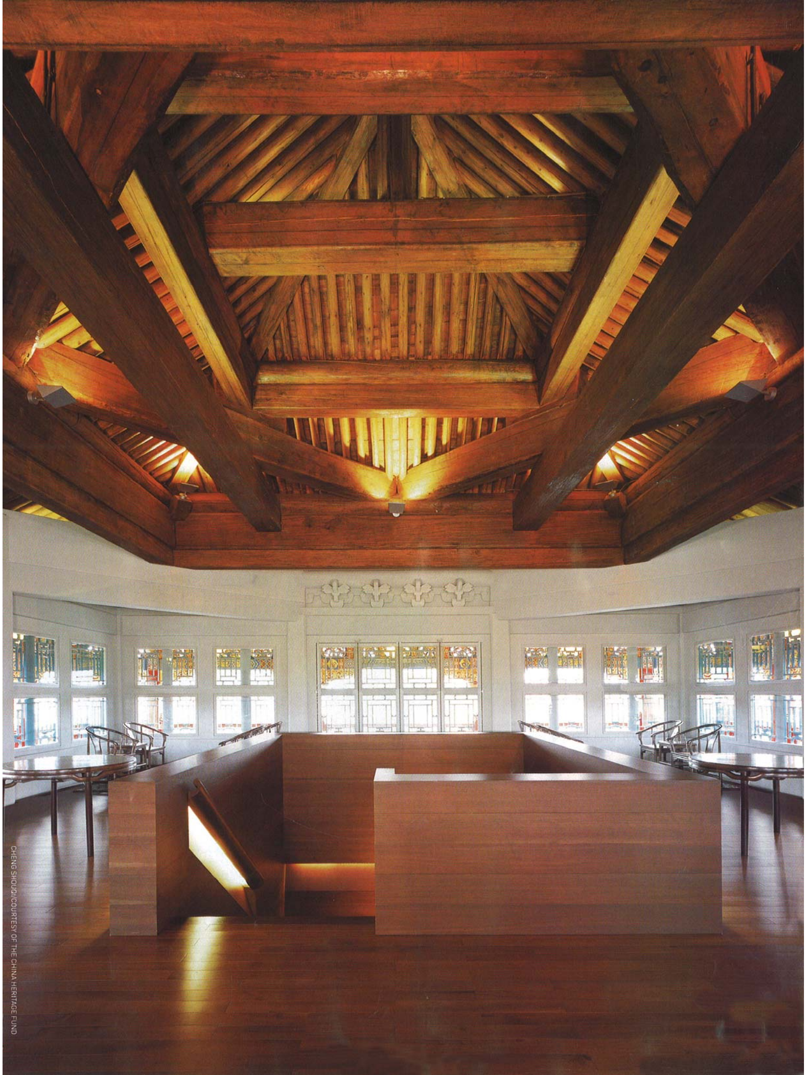
CHENG SHOUJUN/COURTESY OF THE CHINA HERITAGE FUND